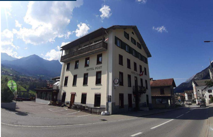
Hotel Post Cunter